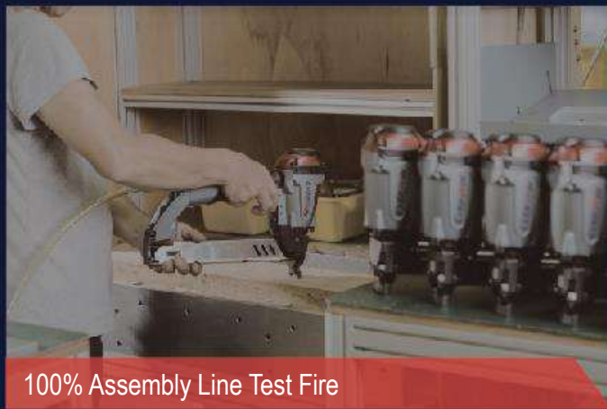
100% Assembly Line Test Fire