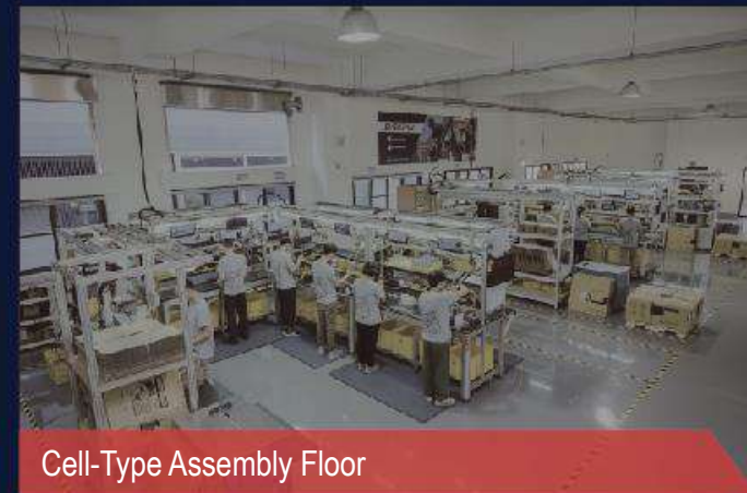
Cell-Type Assembly Floor