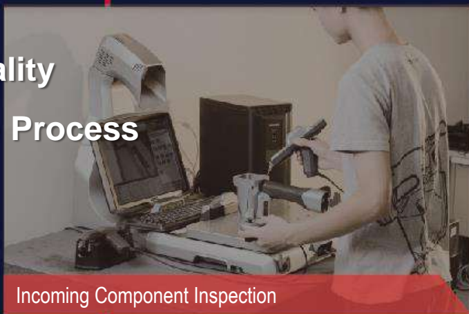
Incoming Component Inspection